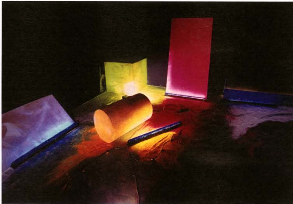
ABOVE: KEITH SONNIER'S DIS-PLAY , 1970, FOAM RUBBER, FLUORESCENT POWDER, STROBE LIGHT, BLACK LIGHT, NEON, GLASS, SITE SPECIFIC/SIZE VARIABLE.

KS: There are historians who will say, "Oh, well, now this is different because they don't make this color anymore, or they don't make this foam anymore . . ." These are minor things. It's the overall picture of the form and the language and how it's used. It's just like a writer: You might, after you write a text, refine it and add to it. The